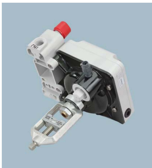
E10k™ Chlorinator (Rear View)

The E10k™ Chlorinator is warranted for 3 years against defects in material and workmanship. The vacuum regulating spring, injector spring, pressure relief spring, and inlet cartridge are warranted for life against chemical attack. The PM Kit® parts are warranted for 1 year.