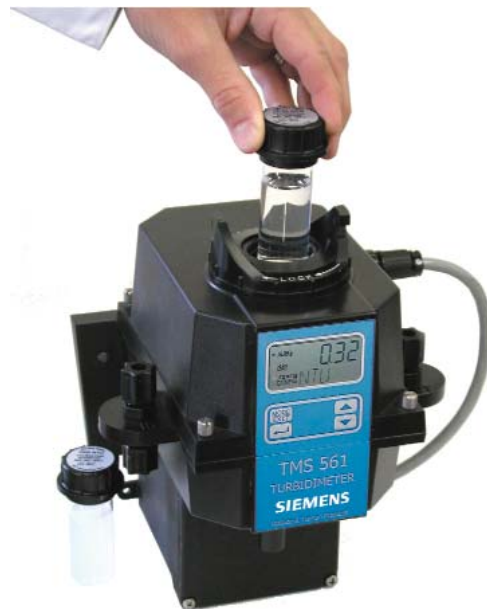
TMS 561 turbidimeter with Calibration Cuvettes

In the TMS 561 turbidimeter, a continuous sample of the process to be measured flows through the meter. The measuring chamber consists of a rotational flow-through assembly with a replaceable glass cuvette. A specially designed flow head eliminates the need for a bubble trap and ensures an immediate response time. Either a white light or IR light lamp generates a beam of light, which is passed through the sample. This light is measured by two sensors arranged at an angle of 90°. The resulting signal is conditioned by the integral electronics to provide a turbidity measurement reading in NTU. When calibrated against a known turbidity standard, the TMS 561 turbidimeter provides an accurate indication of turbidity on a continuous basis.