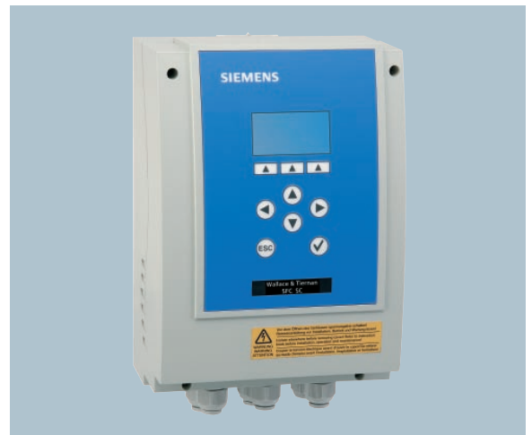
The intuitive menu structure is controlled via 3 function keys, 4 navigation keys and an escape and acknowledge key.